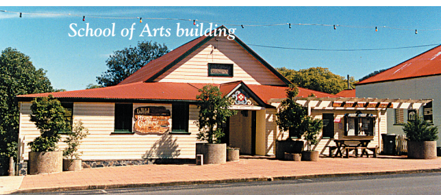
School of Arts building

The posts are oriented so that when you are looking at the photo on the post you are also facing the same scene as it exists today.